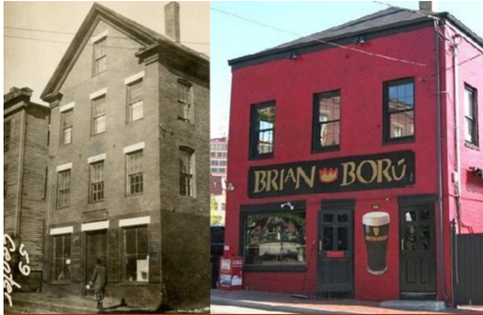
Photo below right: The Tracy-Causser block, a local landmark, before and after rehabilitation.