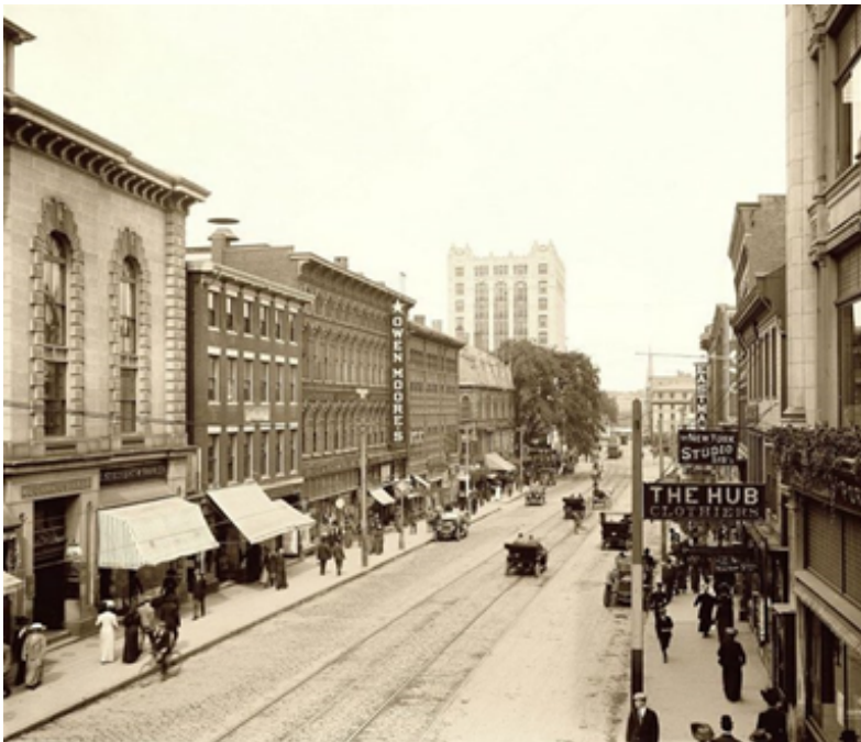
Photo above: 1910 image of Congress Street, Mechanics' Hall to the left.