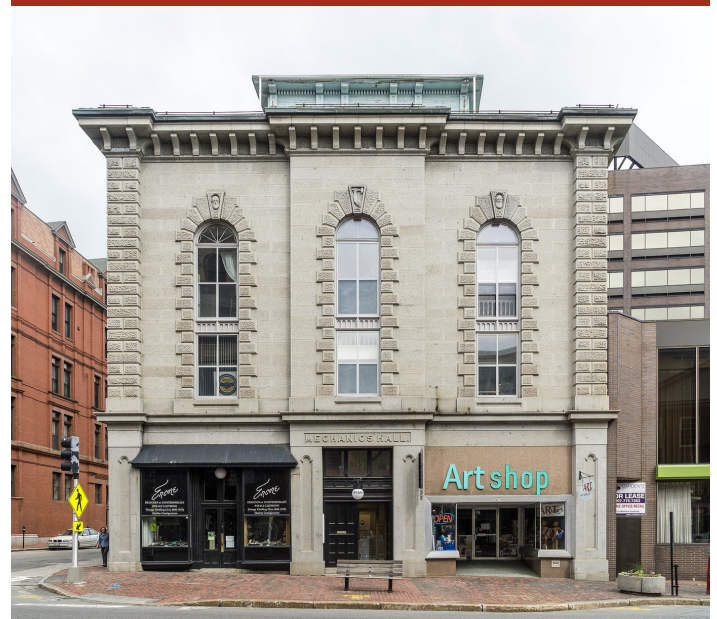
Photo below right: Current image of the facade of Maine Mechanics' Hall.